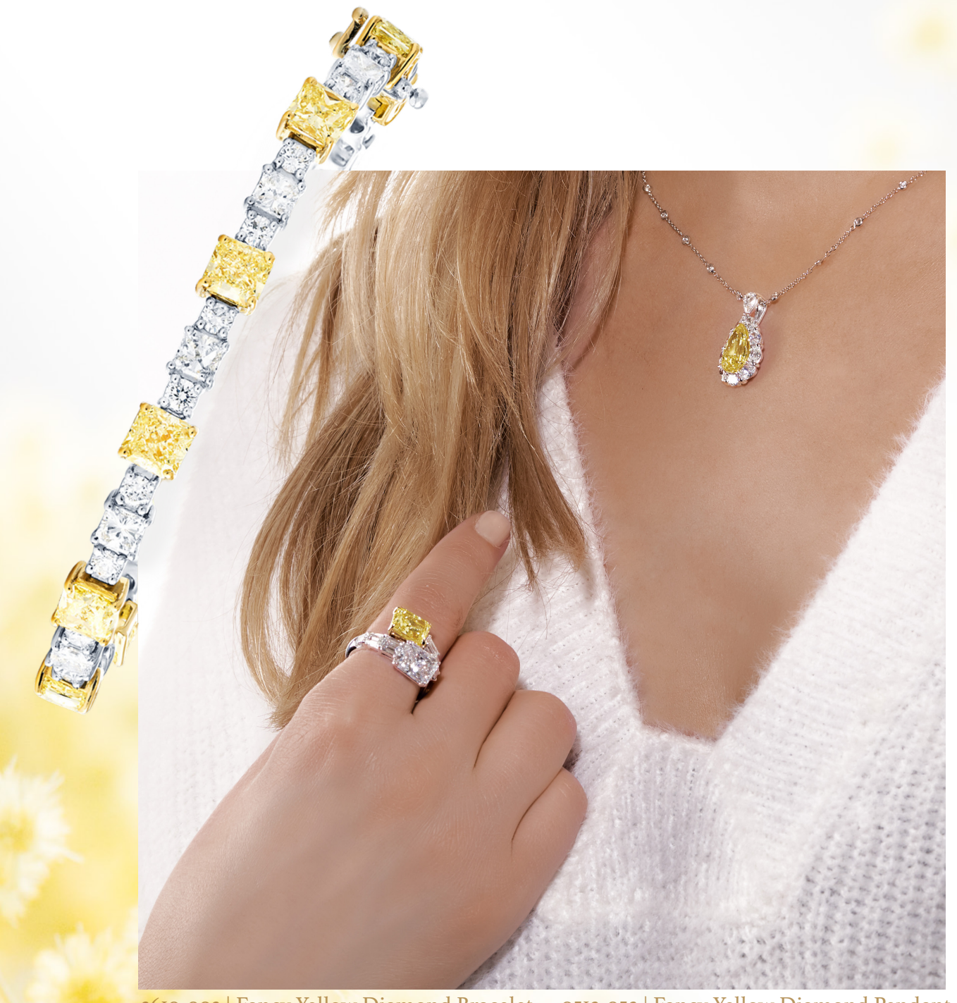
3610-003 | Fancy Yellow Diamond Bracelet 0512-052 | Fancy Yellow Diamond Pendant 5597-006 | Twogether Fancy Yellow Diamond Ring