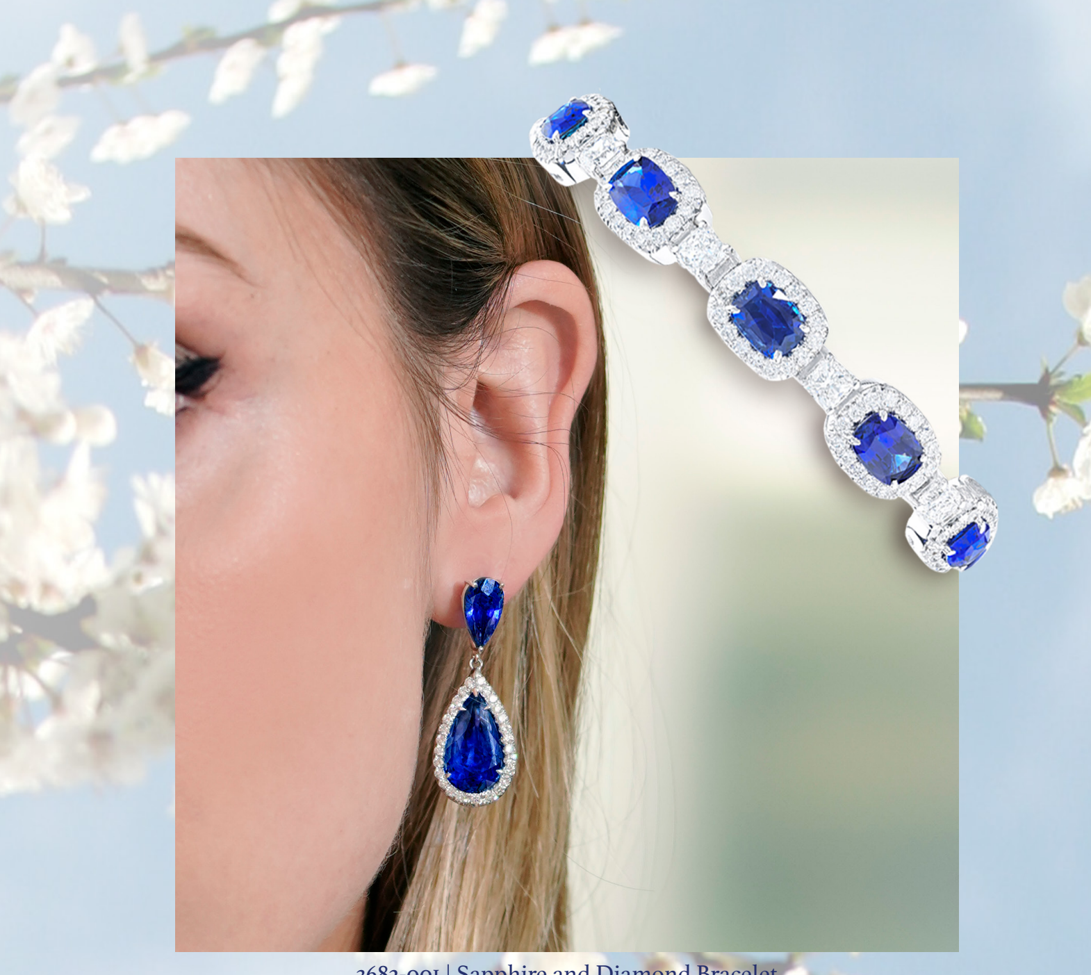
3682-001 | Sapphire and Diamond Bracelet 6093-011 | Sapphire and Diamond Drop Earrings